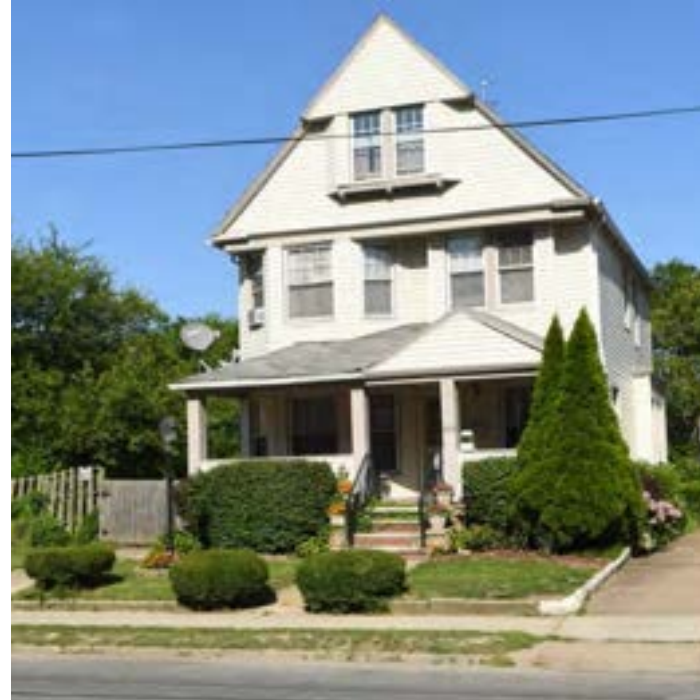
2209 East 79th Street