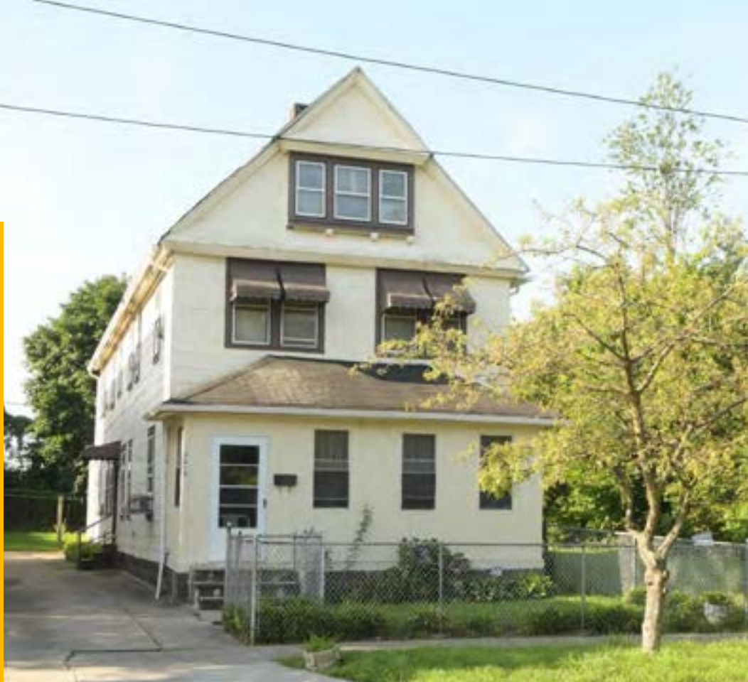
10018 Quebec Avenue