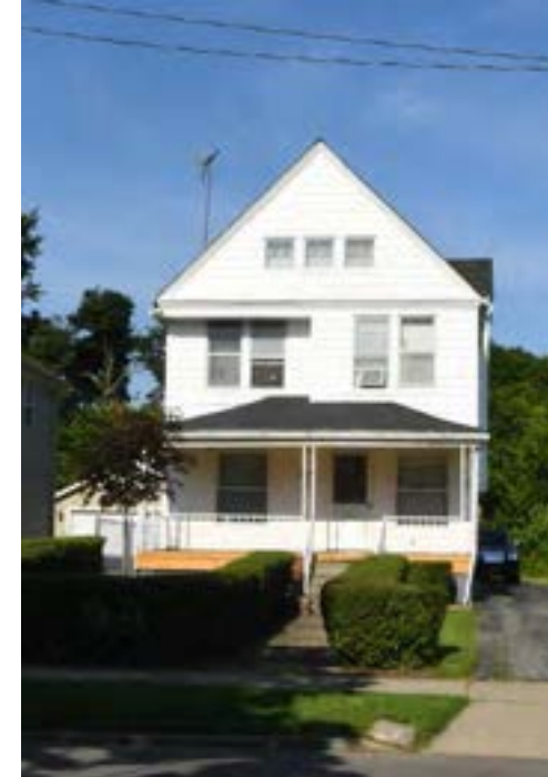
2282 East 100th Street